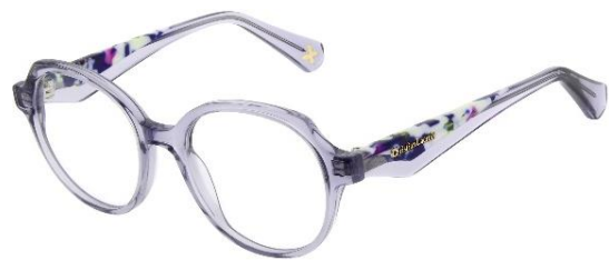
692 Grey / Marbellous