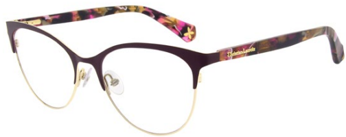
CL3058 Bordeaux 221