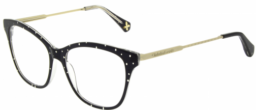
CL1111 084 PLUMETIS 55/16-140