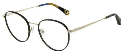
500 (C04) LICHEN / DORE / ECAILLE