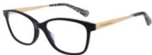
CL1109 Jais/Berlingot 001