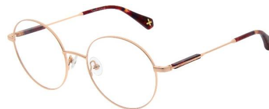
404 (C04) DORE ROSE / ECAILLE ROSE