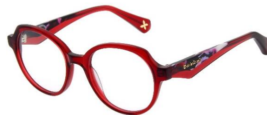
991 Red / Cassata