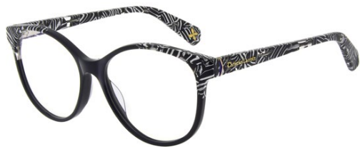
CL1096 Berlingot 098