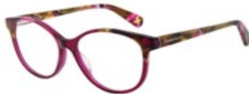
Cassata Bordeaux 217