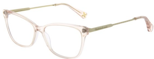
CL1105 Peche 405