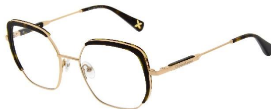
404 (C04) DORE ROSE / ECAILLE