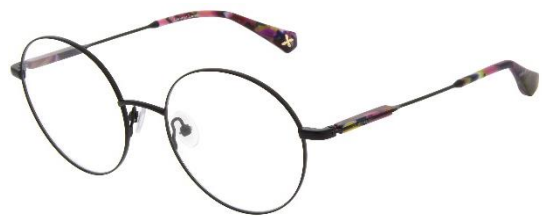
001 (C01) JAIS / ARTY