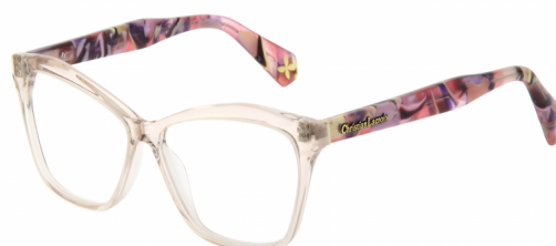
405 PECHE/CASSATA ROSE