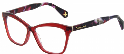
CL1106 228 COQUELIQUOT/CASSATA 51/12-140