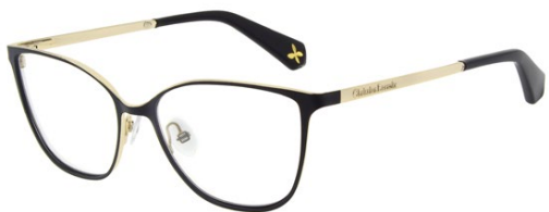
CL3059 Jais 001