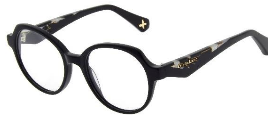
290 Black / Cassican