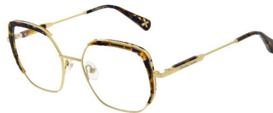
403 (C01) DORE BRILLANT / ECAILLE BLEU