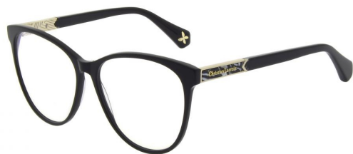
CL1113 038 JAIS/BERLINGOT 56/14-140