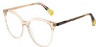
Peché/Pietra Dura 405