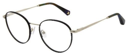
004 (C01) JAIS / DORE / MARBELOUS