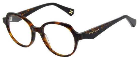
489 Tortoise / Black