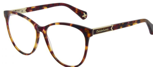
299 ECAILLE ROUGE