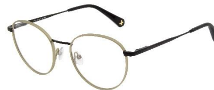
401 (C02) DORE / JAIS / JAIS