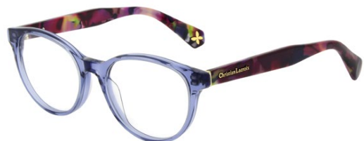
CL1103 Horizon/Arty 601