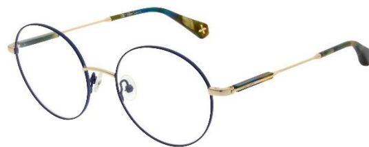
600 (C03) MARINE / MARBELOUS