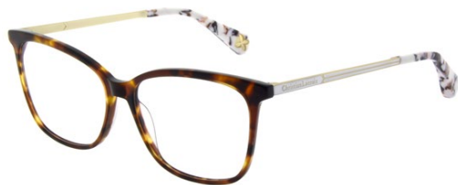
CL1104 Ecaille/Marbelous 175