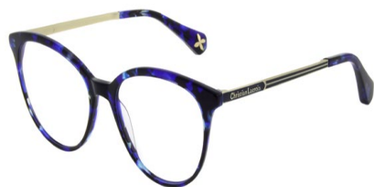
CL1108 Ecaille Marine 693