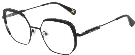
001 (C02) JAIS / JAIS